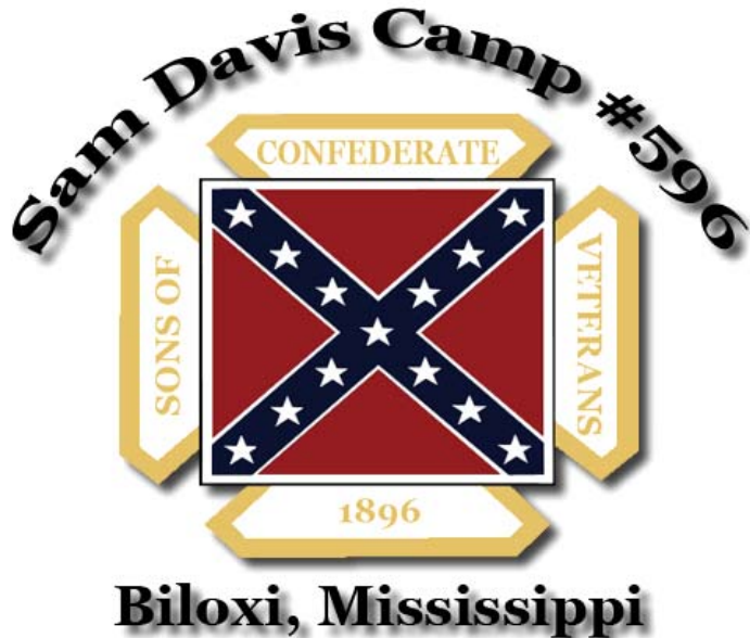
FRONT POCKET DESIGN